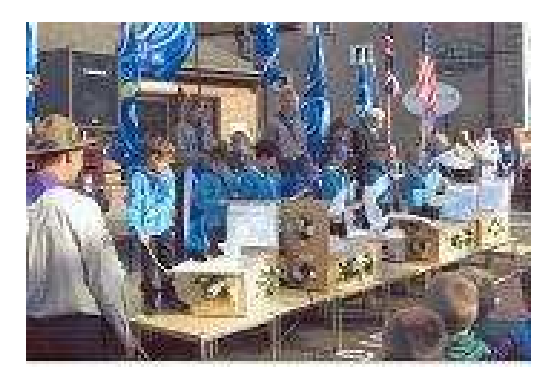
Release of 100 white doves on Sunrise Day

One reason has been the activity surrounding the Centenary of Scouting - a year packed full with so many different events that, at one point, we wondered if we were reaching overload! Let me comment on just a couple.