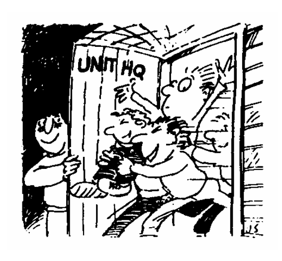
The final escape !!??